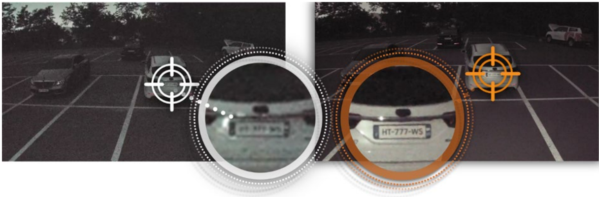
Image 3. Conventional noise reduction (left) and Wisenet7 Wise NR noise reduction (right) comparison