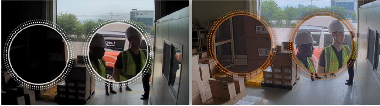
Image 2. Conventional WDR (left) and Wisenet7 extreme WDR (right) comparison